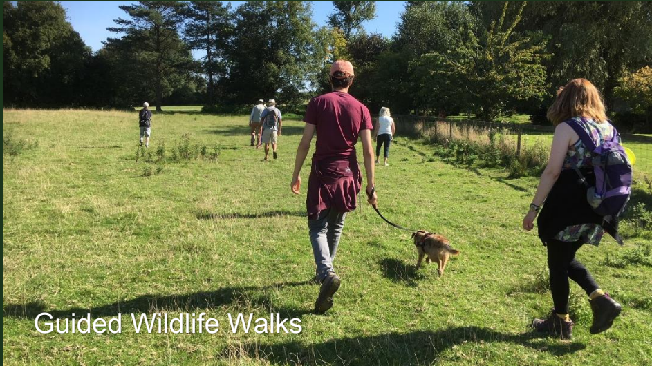
Guided Wildlife Walks