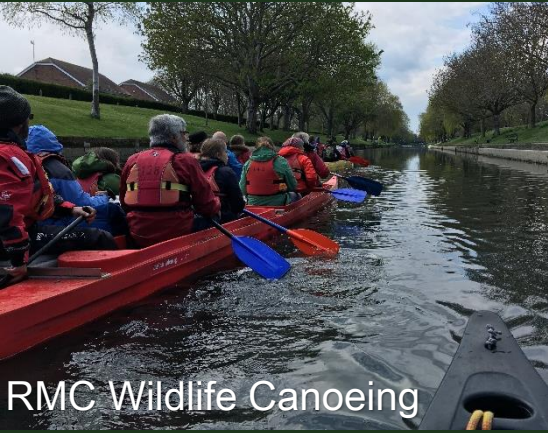
RMC Wildlife Canoeing